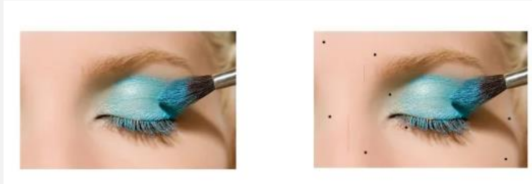
Extremely Low Pixel Failure Rate